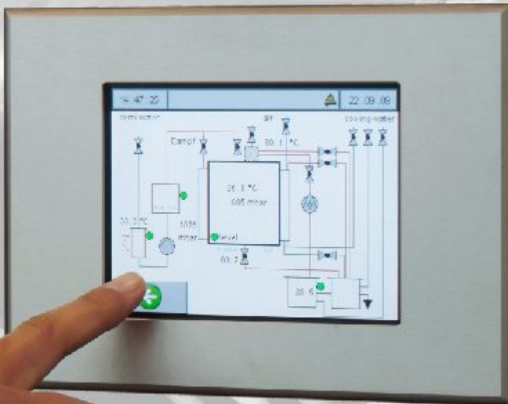
HMI - Touch Panel